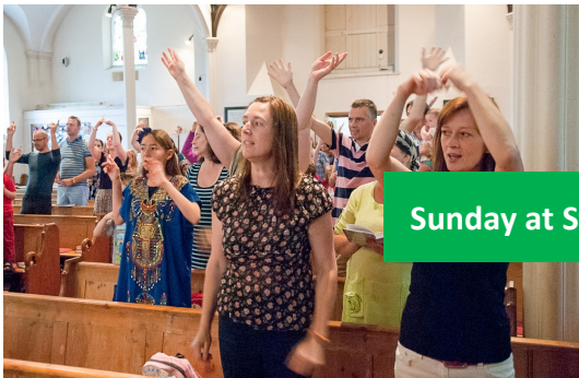
Sunday at St Michaels and All Souls'