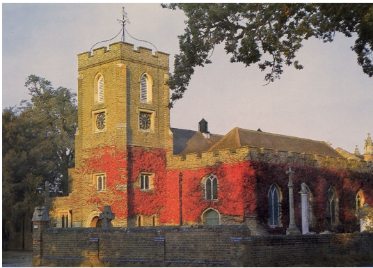
St Michael's in the autumn