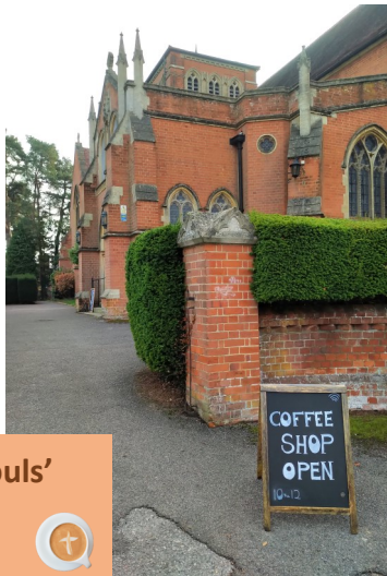
Welcome to All Souls' Coffee Shop