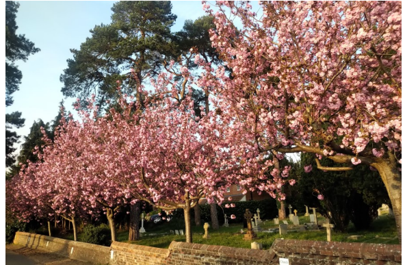
All Souls' in the spring